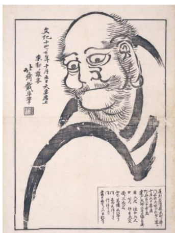
Section 3 Promotional Handbill for Hokusai's Performance of Painting a Huge Portrait of the Bodhidharuma Nagoya City Museum (1 st term)