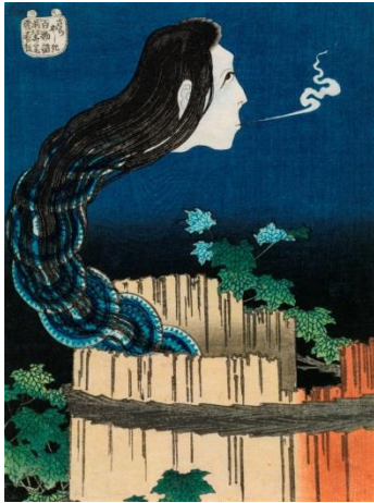
Section 3 Okiku's Ghost at the Plate Mansion, from the series One Hundred Ghost Stories