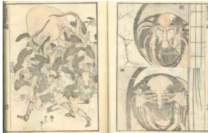
Section 2 Sketches by Hokusai, vol.12